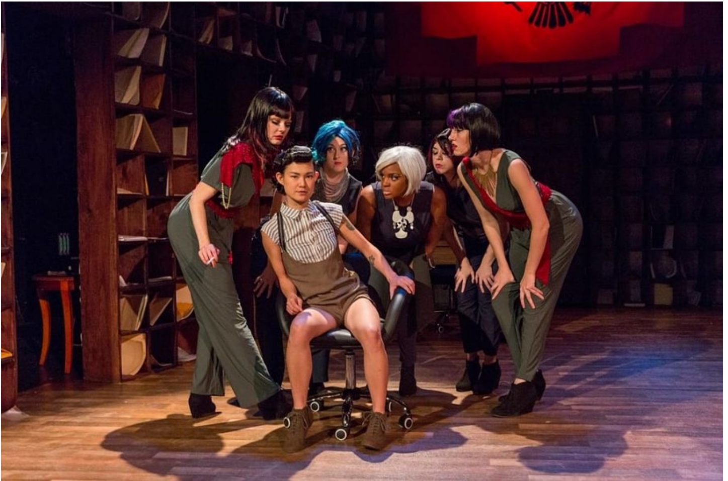
The cast of "The Offending Gesture" at the Connelly Theatre.

I like classical music and choruses in classical music. Even when I was in college I was interested in choirs.